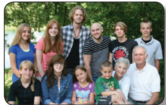
Our grandchildren are growing up!